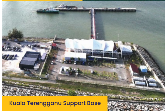
Kuala Terengganu Support Base