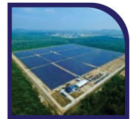
Renewable Energy & Green Technology