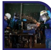
Engineering & Maintenance Services