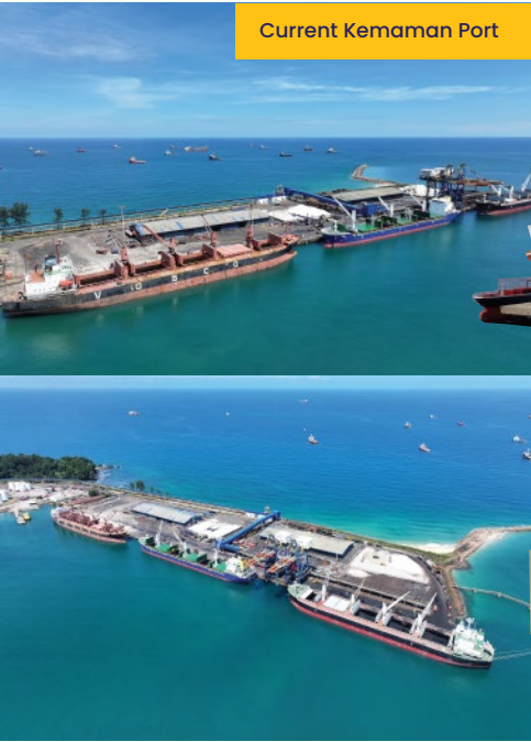
Current Kemaman Port

The development plan is to meet the growing demand by optimising port capacity.