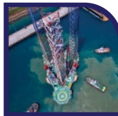
Marine Engineering & Services