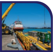
Oil & Gas Supply & Support Base

Eastern Pacific Industrial Corporation Berhad (EPIC Berhad) is a Terengganu Government-Linked Company (GLC), operating as an integrated oil and gas solutions provider across both the upstream and downstream value chains. Its core business lies in providing base services tailored to the offshore oil and gas industry. Additionally, the company offers port management services, marine engineering and services, as well as engineering and maintenance services. EPIC Berhad is also a key player in the renewable energy and green technology sectors, contributing to Malaysia's transition towards a greener energy mix and supporting the nation's efforts to build a low-carbon and resource-efficient economy.