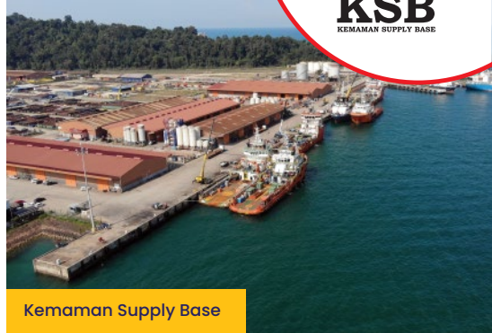
Kemaman Supply Base

The recently operated KTSB functions as a crew change hub complete with embarkation and disembarkation facilities for the oil and gas industry.