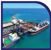
Commercial Port Management